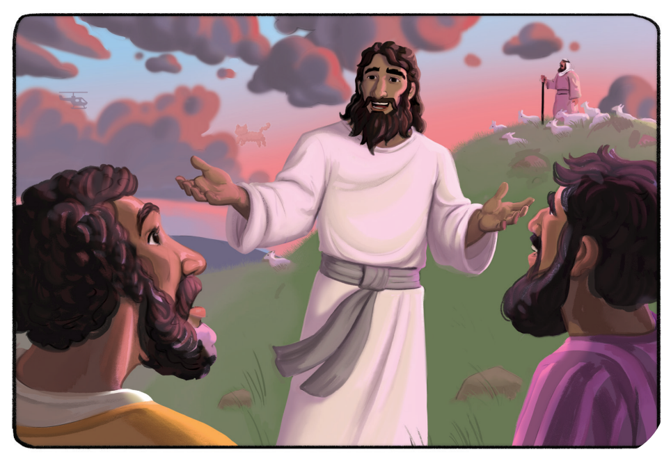
What's Different? | Find and circle the 10 differences between the two pictures.